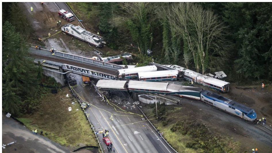
Amtrak Cascades Train 501 derailed on December 18, 2017.