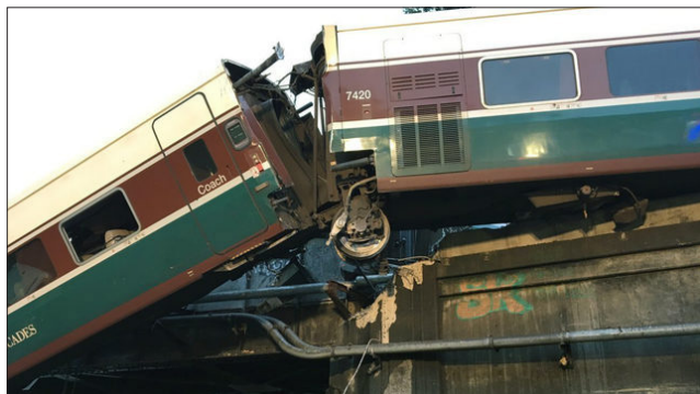
A close up look at Amtrak Cascades Train 501.

As a former volunteer firefighter/paramedic, I’ve worked crash scenes and mass-casualty incidents, and I’m familiar with the very human need to affix blame, to know why there is tragedy, to understand how ordinary life can become carnage in the blink of an eye. My brother and sister firefighters were still on-scene on Interstate 5 that Monday