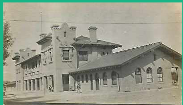
A picture of the Tucson Depot from 1907.

4 - Tucson is full of great transit options. Sun Link connects the University of Arizona to downtown and the