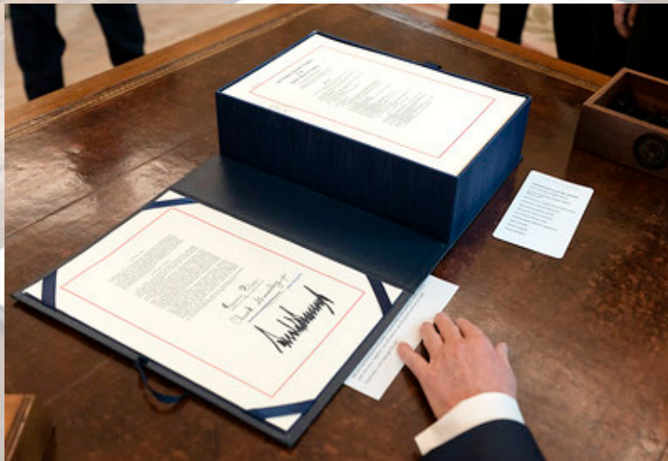
CARES Act Package

The bill (H.R. 748) provided Amtrak over $1 billion in aid to weather the precipitous drop in ridership, and directed $25 billion to the nation’s struggling transit providers—the largest single-year transit appropriation in U.S. history.